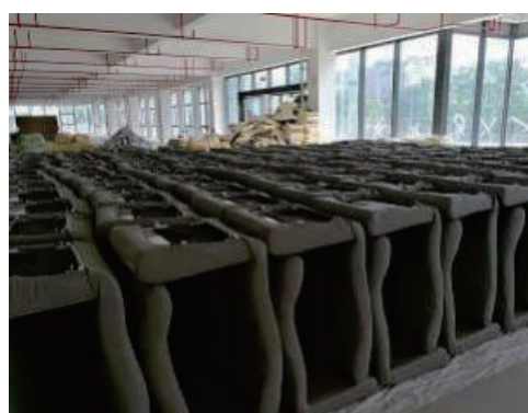
Passenger Seats to Thailand