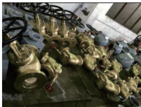
Marine Valves to France (for FPSO Vessel)