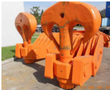
300Ton Lifting Hook to USA