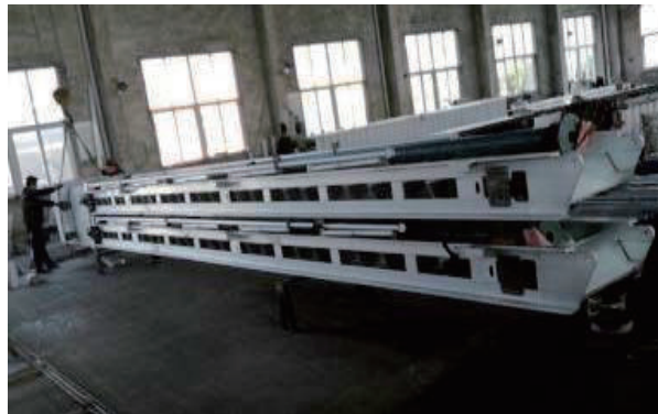
Accommodation Ladders to Indonesia