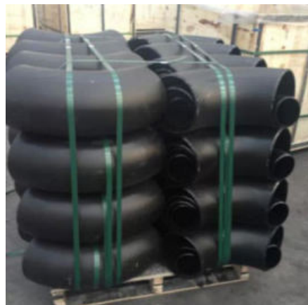
Pipe Fittings to Vietnam