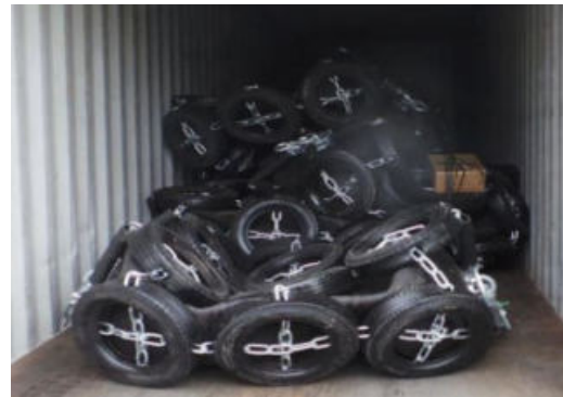
Rubber Fenderto Kuwait