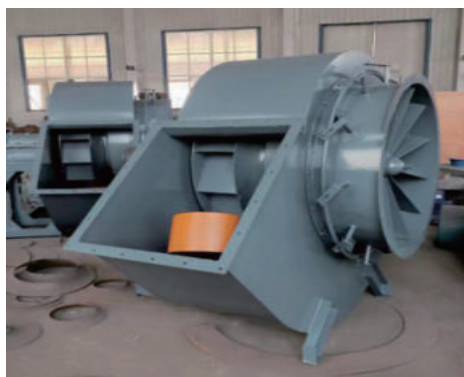
Marine Fans to Australia