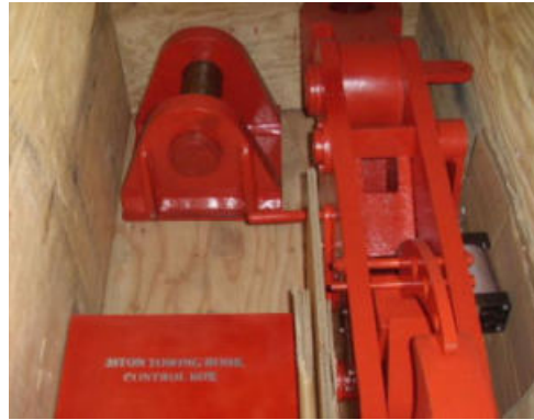
170 sets Square Rubber Fender to the Netherlands 35ton Disc Towing Hook to Vietnam