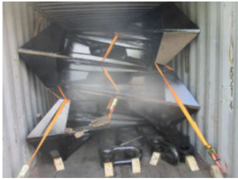
2500kg Flipper Delta Anchor to Israel