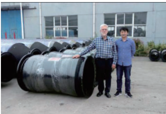
12pcs Armored Rubber Hoses to U.S.A