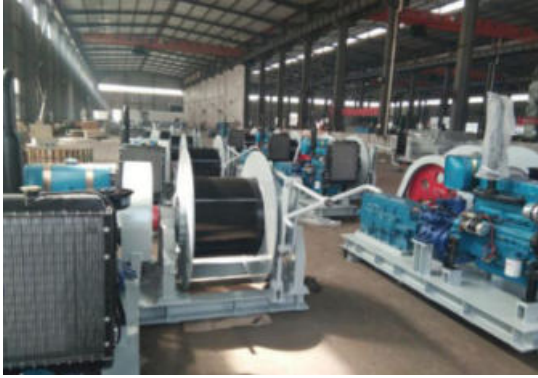
Diesel Engine Winch to Indonesia Shipyard