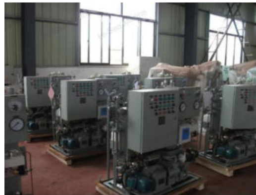
Marine Bilge Water Separator to the Netherlands