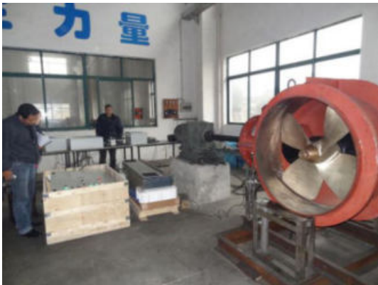
Thruster to Indonesia Shipyard