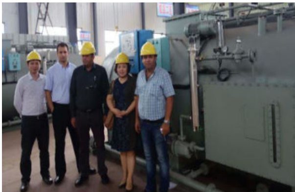
Marine Sewage Treatment Plant to the Middle East