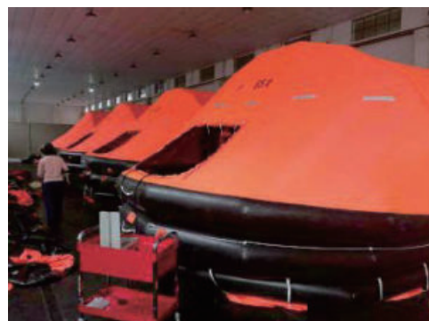
Life Rafts for Sea Crest Marine shipyard