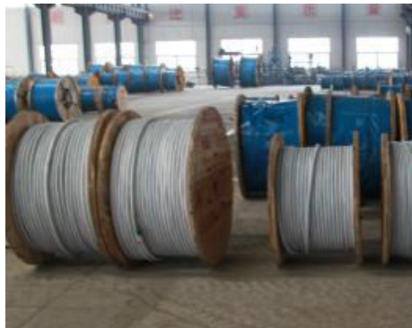
Marine Cable to Indonesia Shipyard