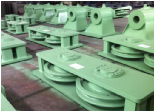
Mooring Equipment to Germany