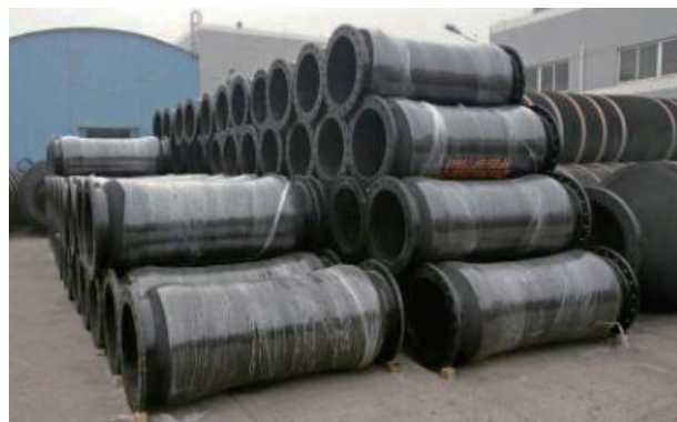
250pcs Dredger Discharge Rubber Hoses to Middle East