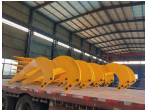
Stingray Anchor to Australia