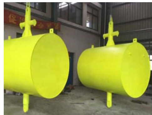
Floating Rubber Fender to the Middle East