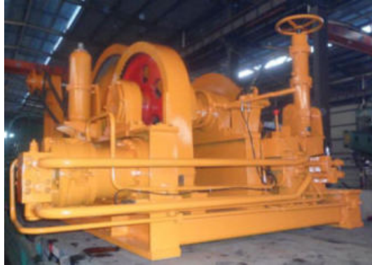
250KN Mooring Winch to Qatar