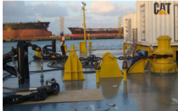
All the Barge Equipment to Lebanon