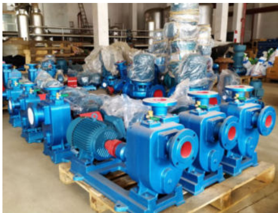
Ballast Fire Pump to Singapore