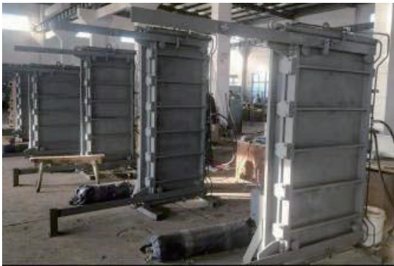
Hydraulic Watertight Sliding Doors to Canada