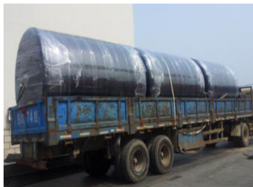
3M Steel Plate Pre-Treatment System to Middle East