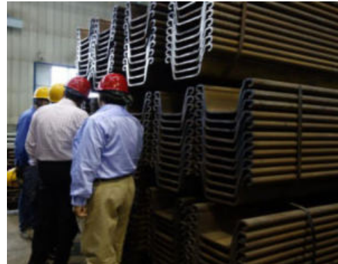
Steel Pile Project to Pakistan