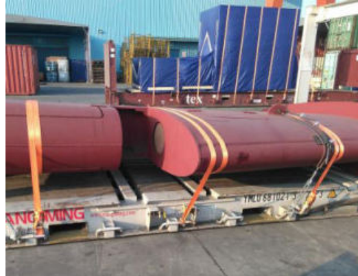
ABS Class Rudder Blade for Marcopolo Shipyard